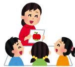
Wednesday Nursery Class

Our Wednesday evening ministries continue this month with a meal at 5:30 and Bible studies at 6:00 for Nursery, Elementary, Youth, and Adults! We would love for you to join us!